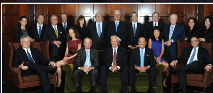
Sullivan Papain Block McGrath & Cannavo P.C.

Also inside: Largest Verdicts and Settlements of 2018