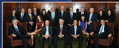
Sullivan Papin Block McGrath & Cannavo P.C.