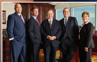
Duffy Duffy Law